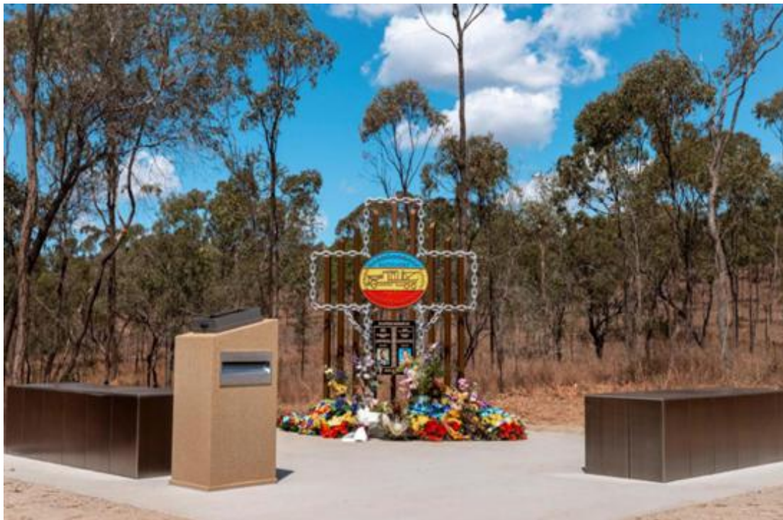
RAEME Recovery Mechanics Memorial North Queensland