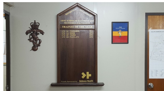
OJT Trainee of the Year Board

One other vitally important aspect of our job is to find, develop and maintain good working relations with our civilian business supporters. As most would be aware they provide a valuable link in the training chain, which is extremely beneficial for the OJTs, exposing them to a variety of equipment and technologies. To achieve this aspect of our role we are required to regularly visit each detachment, military and civilian, to ensure the needs of the OJT and the needs of the unit or business are also being met.