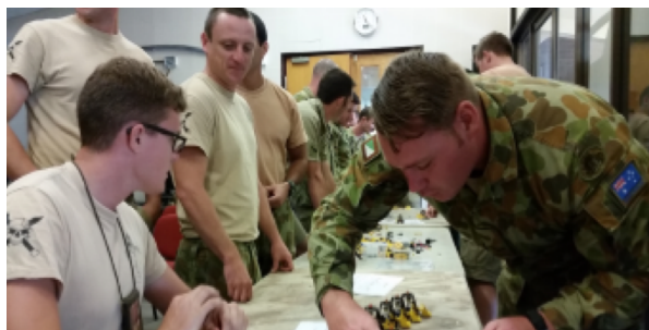
Lean Training Exercise at 2/14 LHR (QMI). Modelling process designed to streamline production, remove waste and improve quality using Lean Principles.