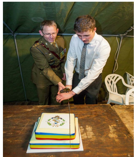
The cutting of the RAEME Birthday cake